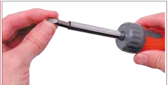
Magnetic bit retention.