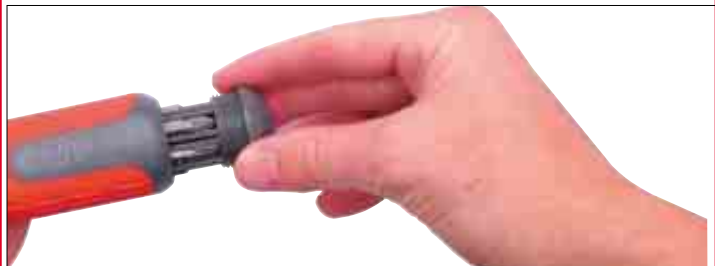
Bit storage in handle.