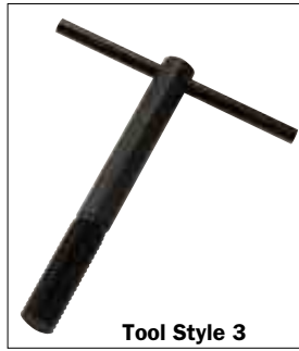
Tool Style 3