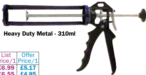
Heavy Duty Metal - 310ml

Heavy Duty Metal Guns Extremely robust and ideal for continuous use. Will not twist under pressure, ergonomically designed to reduce operator fatigue. Very smooth action for optimum application of sealant.