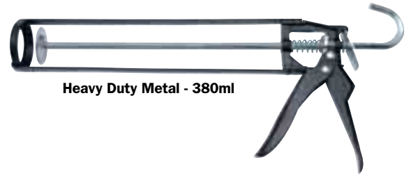
Heavy Duty Metal - 380ml