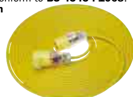
240V Site Extension