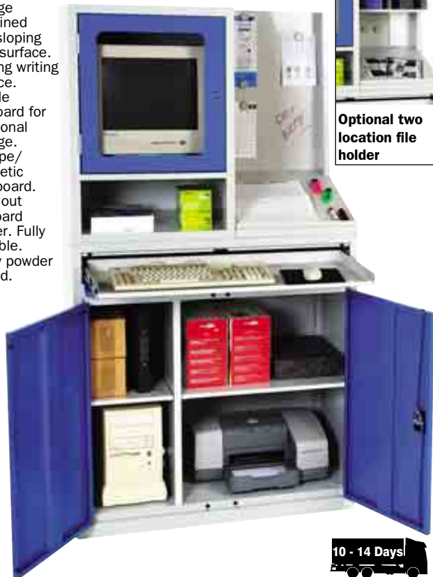
Optional two location file holder

Secure PC storage combined with sloping work surface. Sloping writing surface. Double cupboard for additional storage. Drywipe/magnetic backboard. Slide out keyboard drawer. Fully lockable. Epoxy powder coated.